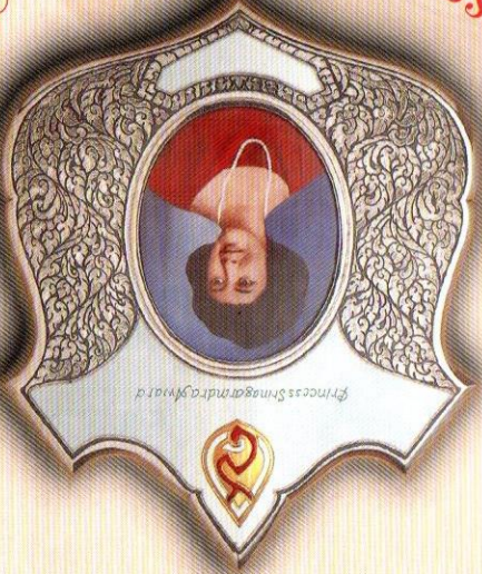
Princess Srinagarindra Award